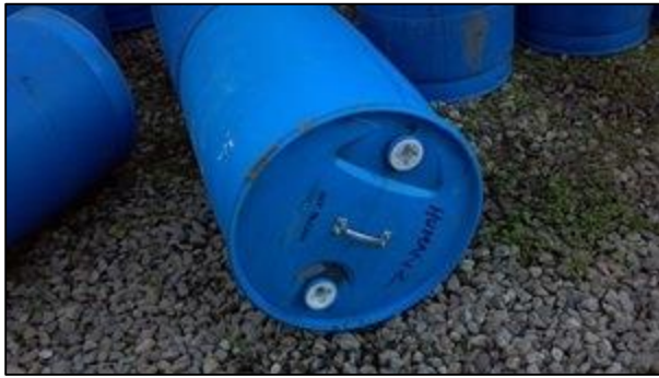
Barrel outside handle