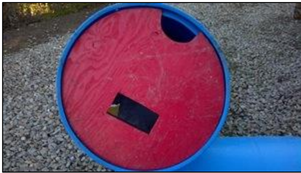
Lid held in place by bungee. Tinted 5% VLT Limo Black