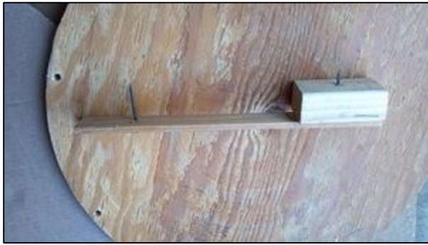
Jig and Protractor